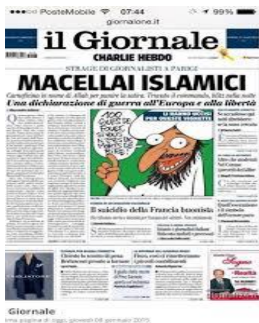
“Il Giornale”, 8 January 2015

http://www.liberoquotidiano.it/news/editoriali/11848405/Belpietro--Bastardi-islamici.html