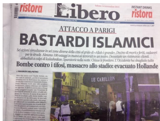
“Libero”, 14 November 2015 11

47. Below some examples on how the media can accentuate the tension, hatred against migrants and Islamic communities: